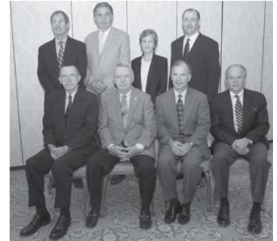
The 2004-05 ASA Council