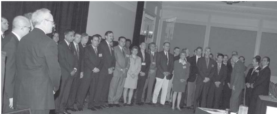
The Class of 2004 Members are formally inducted at the Opening Session.